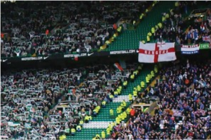
Often dubbed Scotland's shame — Glasgow's 'sectarian' divide

What better way to start a new project for TRUE colours than to create an anti-sectarianism based documentary? This documentary will not only help raise awareness of sectarianism in Edinburgh but will also encourage our members to use their talents to produce an estimated fifteen minute long video. Whether you want to be behind the camera, interviewing, editing, writing a script or even want to use this experience to find out more about sectarianism, then this TRUE Colours project needs you! The video will consist of asking various questions to different people around